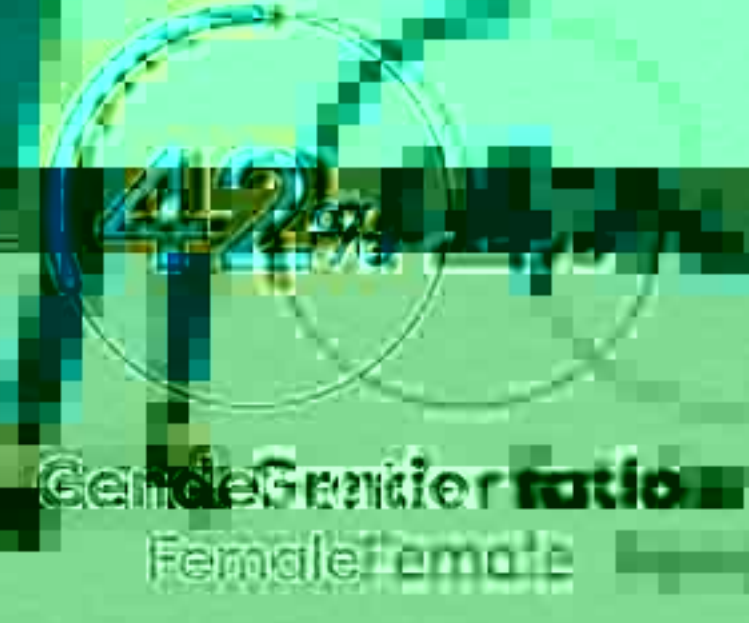
Work Experience by Industry